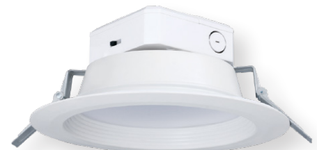
Model # 53189111 shown