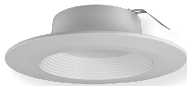
*Model # 53186311 shown