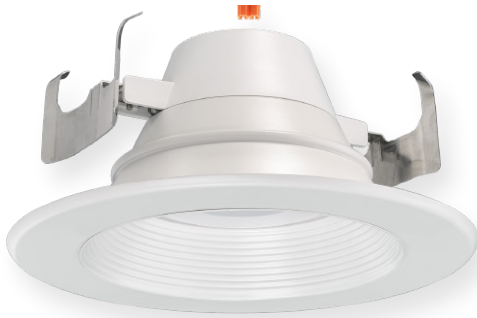
Model # 53801102 shown