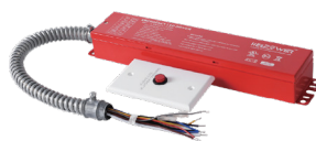
Emergency LED Driver/BBU (BBU field installed w/OC sensor or dimming)