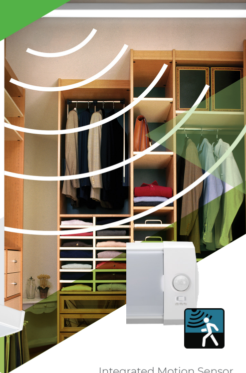
Integrated Motion Sensor