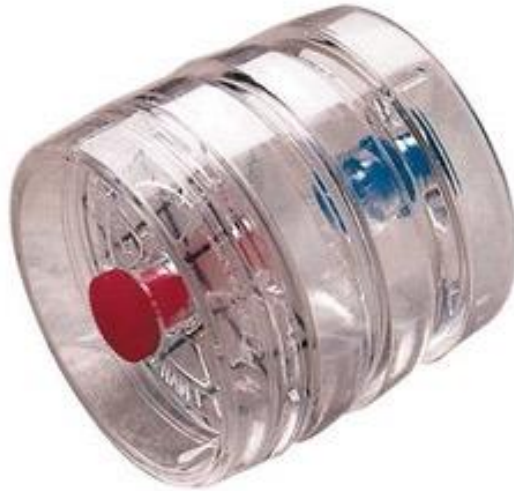
Figure 2: Sensidyne 37mm directionnel air flow sample cassette.

This study used four probes for air sampling, each connected to a calibrated Gilian 10i vacuum device and set at a standard flow of 5.02L/min with a 0.20% tolerance. Sample collection volumes were set to 10-minute draws per time point, which allowed for approximately 50 liters of air collection per collection port. The air sampler operated with a removable sealed cassette and was manually removed after each sampling time point. Cassettes had a delicate internal filtration disc (Fig. 2) to collect virus samples, which was moistened with a virus suspension media to aid in the collection. Filtration discs from Zefon International, Lot# 28875, were used for testing. At each time point, all the sample discs were pooled into one collection tube to provide an average across the four sampling locations.