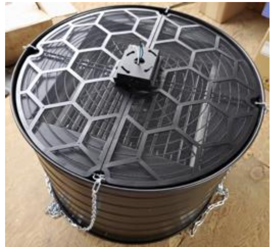
Figure 3. SilentAire Plasma 24" Air Sterilizer as tested.