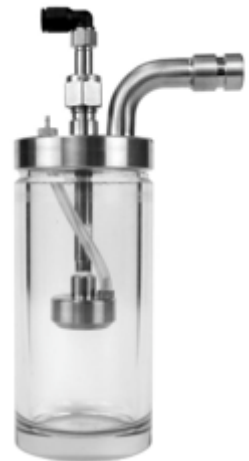
Figure 1: BLAM Nebulizer

Nebulization occurred using a Blaustein Atomizing Module (BLAM), as shown in Figure 1, with a pre-set PSI and computer-controlled liquid delivery system. Before testing, the nebulizer was checked for proper functionality by nebulizing the solution without the test virus present to confirm the average particle size distribution. The nebulizer was filled with 8.65 \times 10^6 TCID50/mL of SARS-CoV-2 in suspension media and nebulized at a flow rate of 1mL/min with untreated local atmospheric air. After nebulization, the nebulizer's remaining viral stock volume was weighed to confirm roughly the same amount was nebulized during each run. Bioaerosol procedures for the controls and viral challenges were performed in the same manner with corresponding time points and collection rates.