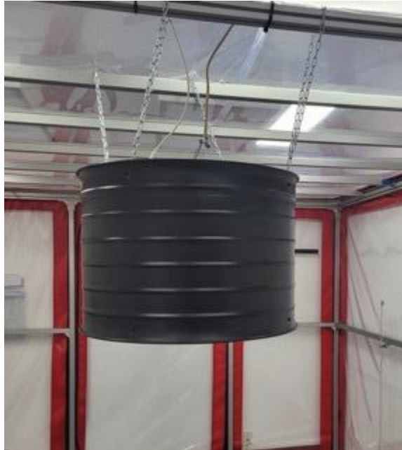
Figure 4. Silentaire Plasma 24" Air Sterilizer mounted in the center of the chamber for testing.