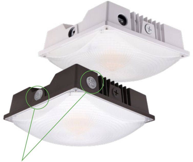
Easy Access to Wattage & CCT select switches