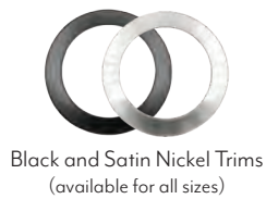
Black and Satin Nickel Trims (available for all sizes)