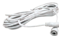
12 ft. and 20 ft. Extension Cables