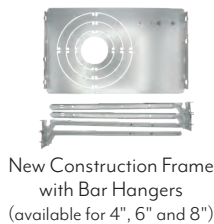
New Construction Frame with Bar Hangers (available for 4", 6" and 8")