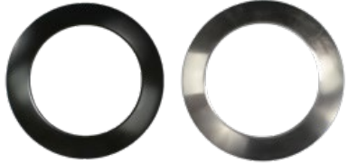
Black and Satin Nickel Clip-On Trims