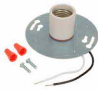
SpeedMount™ Kit included