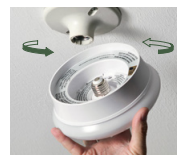
Twists into existing lamp holder, just like a light bulb