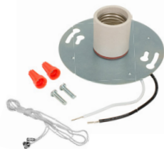
SpeedMount™ Kit and 36-Inch pull string extension included