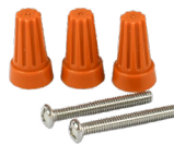
Mounting screws and wire connectors included.