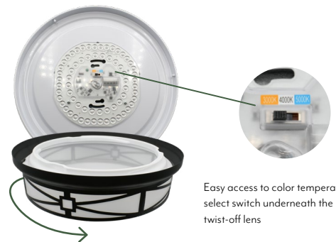
Easy access to color temperature select switch underneath the twist-off lens