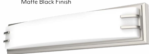
Brushed Nickel Finish