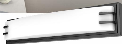
Matte Black Finish